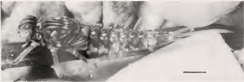
Fig. 4. Live male larva of Camelobaetis variabilis , n. sp. from Devils River, Texas. Scale bar equals 1 mm.